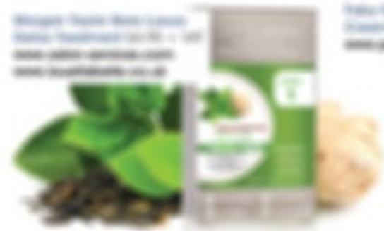
Mavex Calluspeeling Starter Kit 50ml + 100g Available from www.mavexsa.com