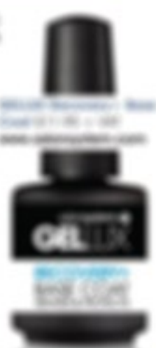
LUXE Nail Oil 50ml + 100g Available from www.mavexsa.com