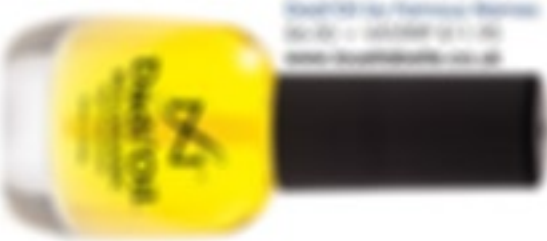
Intensive Nail Solution 50ml + 100ml 11.99 www.mavexsa.com