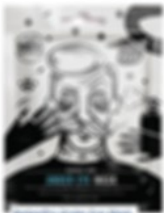
Facial Skin Care Kit 50ml + 100ml 14.99 www.mavexsa.com Including a facial cleansing solution and a skin care kit.