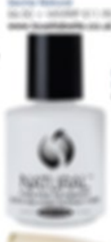
NAIL OIL 50ml + 100g Available from www.mavexsa.com