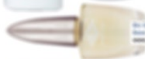
LUXE Nail Oil 50ml + 100g Available from www.mavexsa.com