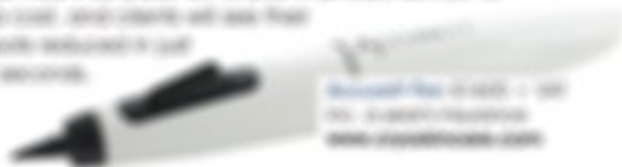
Mavex Calluspeeling Starter Kit 50ml + 100g Available from www.mavexsa.com

The hands themselves often offer a quick and safe way to remove all impurities such as nail polish, pigmentation and other things. Add it as a touch up to your manicure service for a little extra cost, and clients will see that impurities are removed in just ten to fifteen minutes.