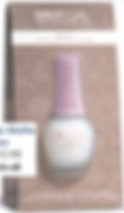
Soothe Itch Relief Cream 50ml + 100ml 11.99 www.mavexsa.com