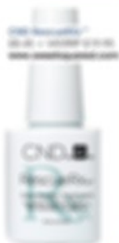
LUXE Nail Oil 50ml + 100g Available from www.mavexsa.com