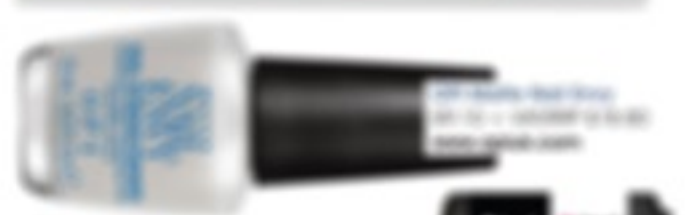
LUXE Nail Oil 50ml + 100g Available from www.mavexsa.com