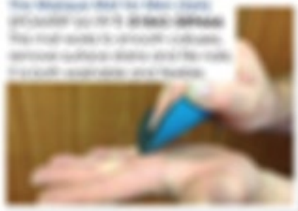
Hand Cream 50ml + 100ml 11.99 www.mavexsa.com The hand cream is a rich, creamy, moisturising cream that is ideal for use after a manicure.