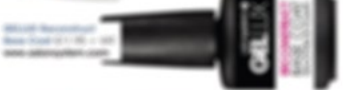
LUXE Nail Oil 50ml + 100g Available from www.mavexsa.com