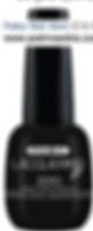
LUXE Nail Oil 50ml + 100g Available from www.mavexsa.com

Start by always offer a basic hand and foot treatments to your male clients for longer term protection and care. Softer and healthier. These options can help strengthen, protect and soften and remove and rehydrate skin too. In three weeks all your clients will see and encourage repeat custom.