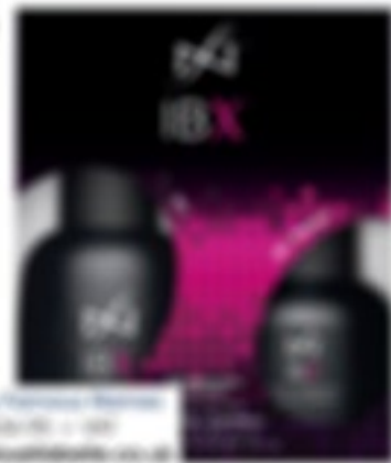
Mavex Calluspeeling Starter Kit 50ml + 100g Available from www.mavexsa.com