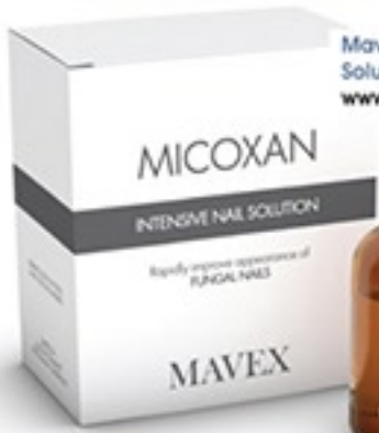
Mavex Micoxan Anti Fungal Solution £17.99 + VAT/RRP £35.99 www.mavexsa.com