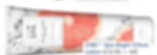
Mavex Calluspeeling Starter Kit 50ml + 100g Available from www.mavexsa.com