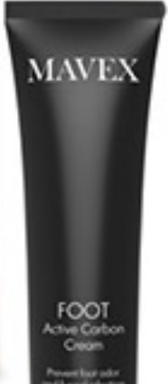
Mavex Active Carbon Foot Cream £11.99 + VAT/RRP £23.98 www.mavexsa.com Eliminates the causes of foot odour by drawing toxins away from the skin.