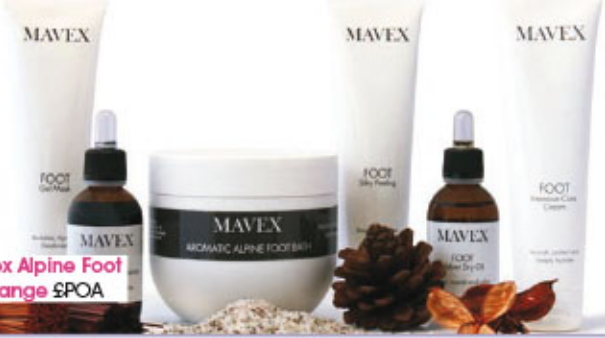
Mavex Alpine Foot Spa range £50A