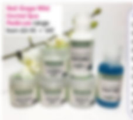
Foot Spa Products £200 - £50