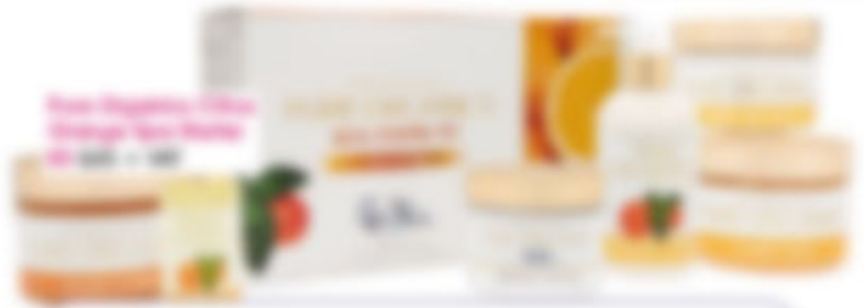
Foot Spa Products £200 - £50